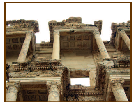
The library of Celsus in Ephesus

A visit to Miletus this morning will include the well-preserved theater and bouleterion. It is here at Miletus that Paul delivered his speech to the Ephesian elders, near one of its four harbours. As we approach Didyma, we will see the remains of the Sacred Way that linked Miletus to this ancient oracle site. The site of Didyma includes the Temple to Apollo, considered to be the finest in the Aegean region. Continuing on to Priene, we will see the best-preserved Hellenistic theater in Turkey and visit the newly excavated remains of a synagogue in the west residential district. Dinner and overnight in Kusadasi. (B,D)