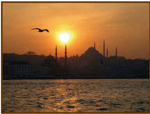
Sunset in Istanbul

Welcome to one of the most captivating cities in the world! Your tour guide will meet you after the customs and baggage claim with a “BAS” sign to take you to your hotel for check-in. Following a short orientation of beautiful Istanbul, we will take a leisurely private boat tour along the Bosphorus, the legendary waterway that connects the Black Sea to the Mediterranean, and divides Istanbul into two continents: Asia and Europe. Once the capital of two of the world’s most important empires—the Byzantine and the Ottoman—Istanbul represents the best of both in its stunning monuments, architectural wonders and world class museums. Following the Bosphorus cruise we will return to the hotel for dinner and overnight. (D)